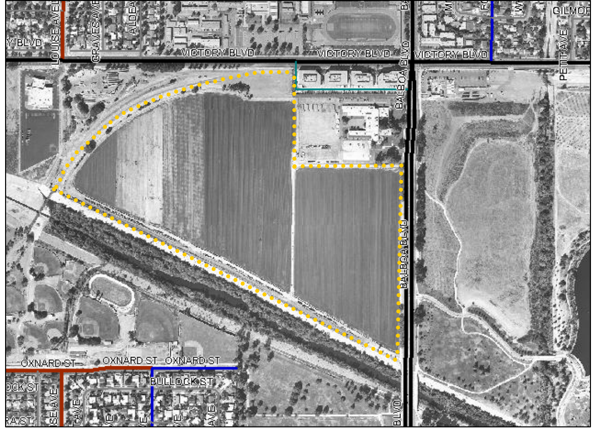
(Project site indicated with dotted line.)

The site is located at 33 degrees 18'45" N and 116 degrees 43'11"W. Scale shown is 1:24,000. The proposed project area is shown with a dashed line. Balboa Boulevard is the border between the Van Nuys Quadrangle (to the east) and the Canoga Park Quadrangle (to the west, which includes the project area).